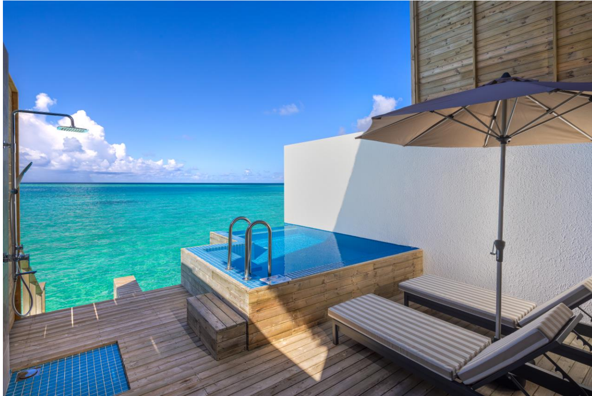
Duplex Overwater Villa with Private Pool (119m 2 )