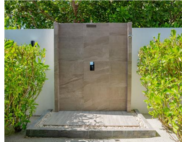
One Bedroom Sunset Beach Villa (62m 2 )