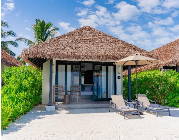
One Bedroom Beach Villa (62m 2 )